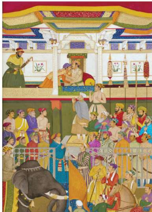
Jahangir Darbar, Gouache & Gold on Wasli, 16 x 22 Inches

Proud horses, raging elephants, grandiose falcons and other exotic birds pepper the compositions as the protagonists go about significant moments of their lives. Beautiful, detailed patterns and motifs emerge on the flowing attire of the Emperors, the Queens/Princesses