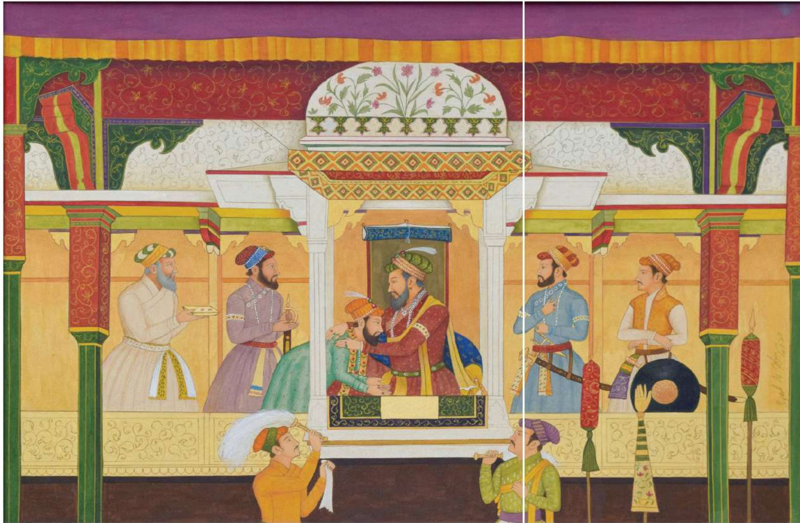
Shah Jahan Darbar 2, Gouache & Gold on Wasli, 12.5 x 20 inches