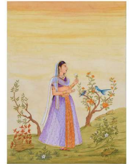
Princess in Garden, Gouache & Gold on Wasli, 10 x 14 inches

Irfan occasionally uses artistic license to break free from traditional compositions found in Mughal miniature paintings. These paintings were originally created by/commissioned by the Mughal Emperors to Master