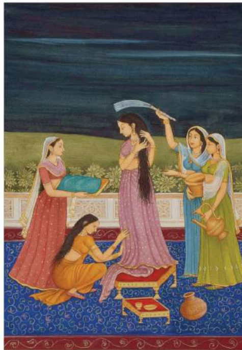
Preparing for Someone Special, Gouache & Gold on Wasli, 10 x 14 inches