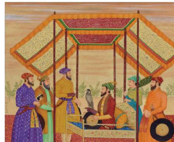
Aurangzeb Alamgir with Followers, Gouache & Gold on Wasli, 10 x 12 Inches

and their disciples, as well as on the ornate carpets, thrones, hand-held fans, marquees, animals, embellishments, cutlery and accessories. Delicate jewels can also be seen adorning both people and animals. Singular, pensive subjects are seen, as well as small to large groups of people in various kinds of communication and action.